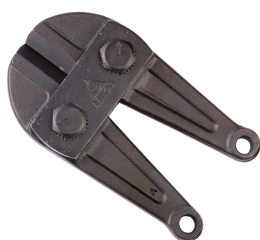
C 6009-450 Bolt cutter head 450mm / C6009450