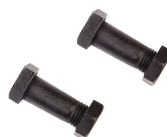
T 6009-450 C Bolt cutter head screws 450mm / T6009450C